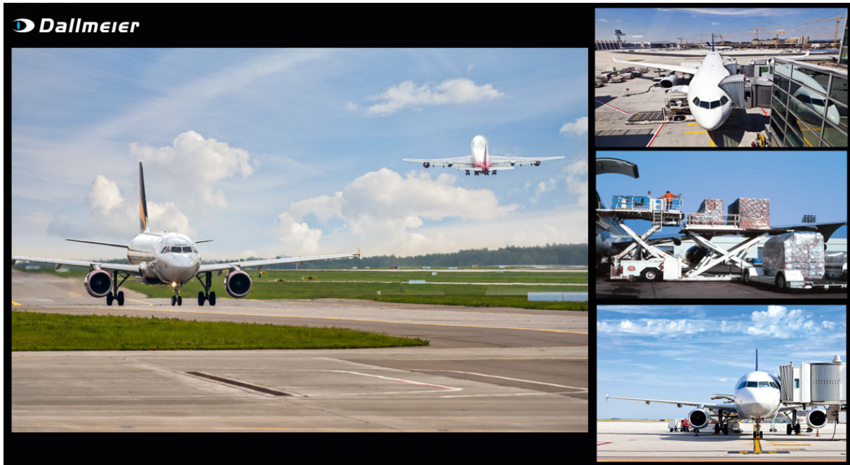
Fig. 2 Example display SeMSy® Decoder Client

The SeMSy® Decoder Client (SDC) software allows independent viewing of video streams from Panomera® systems. The software retrieves the video streams via unicast or multicast directly from the cameras or recording systems as a proxy. After decoding, the streams are output to the connected monitors in multi-split views.