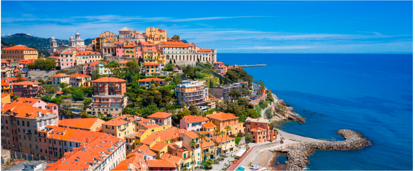
A modern Dallmeier video surveillance system provides more security in Imperia.