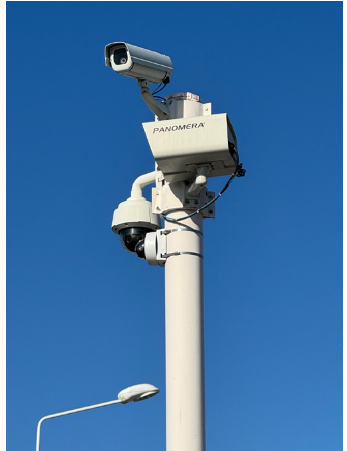
Panomera® cameras are positioned at several strategic locations.

Imperia has been using video surveillance technology for many years. The original system was based on a marina system with numerous cameras from different manufacturers, which were finally integrated into a Dallmeier management system. Later, the marina and city surveillance systems were unified. As a result, not only were additional cameras from other manufacturers integrated into the management system, but a selection of state-of-the-art Dallmeier cameras were also added to the infrastructure.