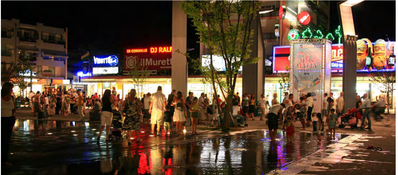
The nightlife of Jesolo in the summer months.

quickly to potential threats. If an incident does occur, the recorded video footage can be used to solve crimes and as evidence in court.