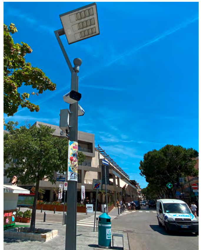
Multifocal sensor technology from Dallmeier provides more security for locals and tourists in public places and streets.

Multifocal sensor technology provides an optimal overview of the entire event and enables comprehensive monitoring in real time. This allows security personnel to respond