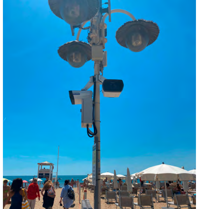
Panomera® cameras also keep an eye on beach areas.

The video system remains flexible, scalable, and expandable. Thanks to state-of-the-art technology, it can be easily adapted to changing requirements. Additional cameras can be easily integrated, and upgrades are seamless. The video system remains a reliable and effective surveillance solution for the future.