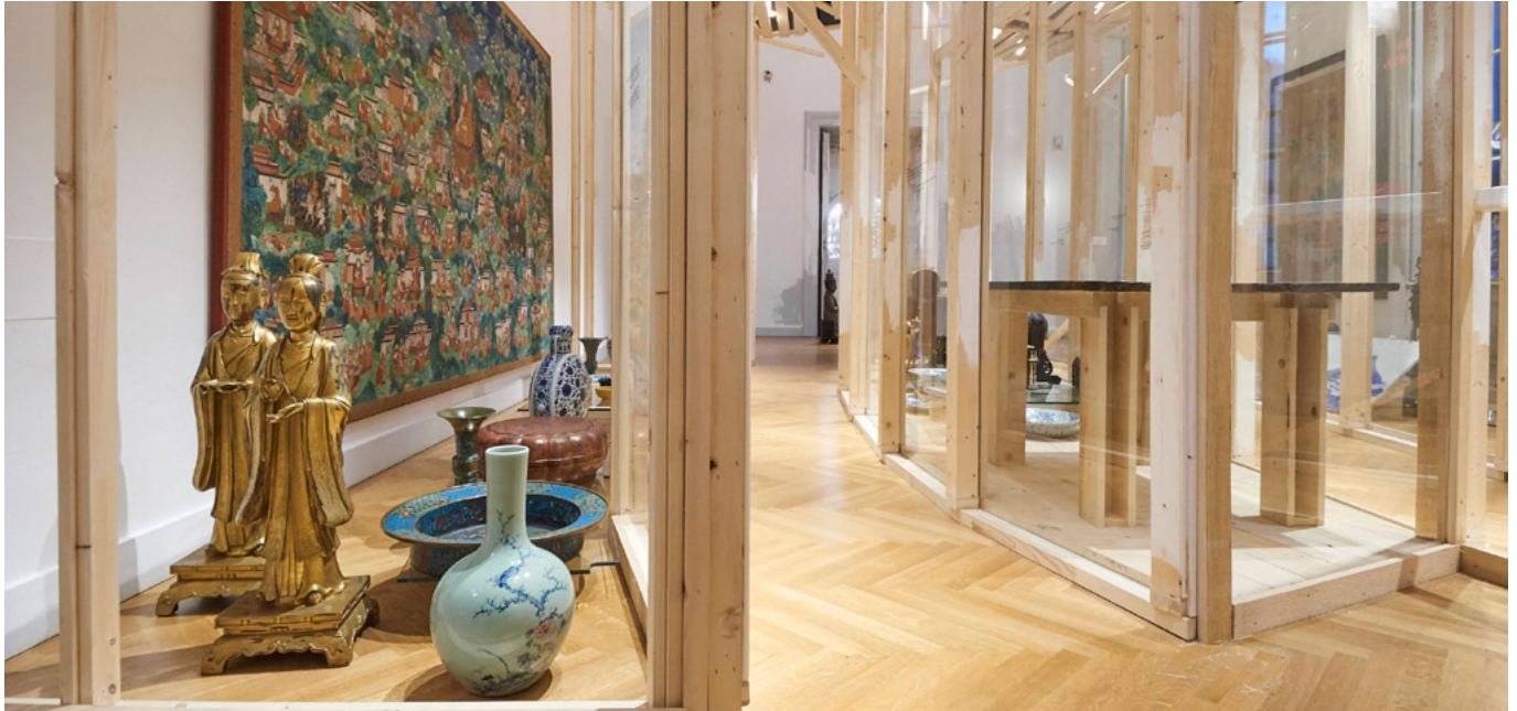
The MAK relies on cutting-edge video technology from Dallmeier to protect its permanent collections.

and significantly reduce false alerts. These technologies not only detect manipulation attempts during operating hours but also play a vital role in protecting sensitive areas after hours.