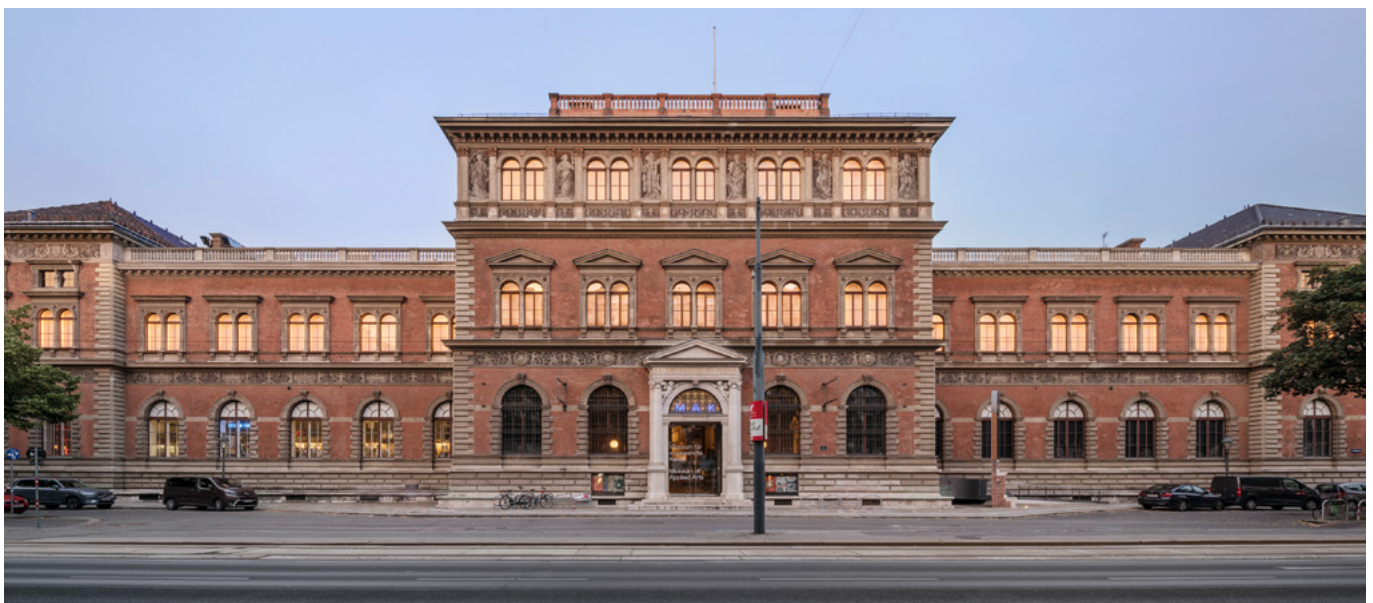
MAK – Museum of Applied Arts.

The installed 4K Domera® cameras deliver high resolution images even in difficult lighting conditions. Thanks to the innovative “RPoD” (Remote Positioning Dome) function, camera angles can be adjusted remotely via the video management system – eliminating the need for labor-intensive physical reconfiguration. This is especially advantageous for the museum's high ceilings and frequently changing exhibitions. AI-based features such as Intrusion Detection and Loitering Detection ensure precise alarms