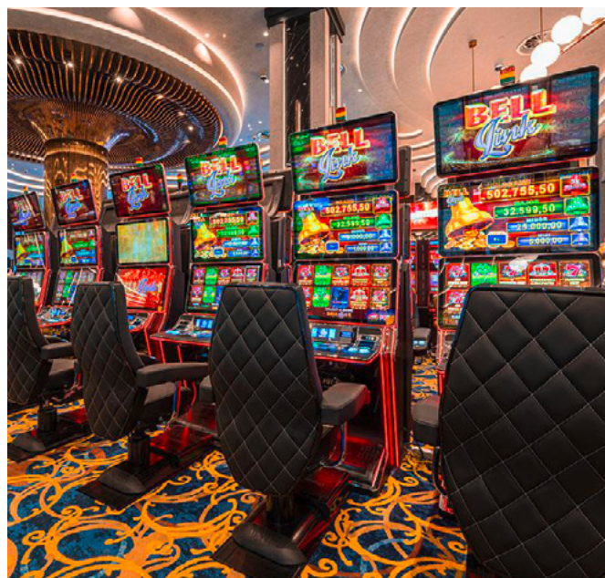
Seamless monitoring for over 300 slot machines

In the central control room, four operators work per shift on three 27-inch monitors each, while 18 large-format monitors provide overall visual control. Recording is handled redundantly via IPS 10000 network video recorders. The entire system is managed using the