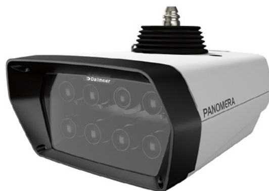
A Panomera® S8 multifocal sensor system provides a complete overview of the gaming area

Surveillance Manager at Grand Sapphire Resort & Casino