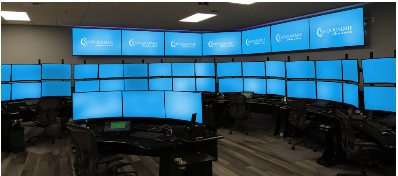
The video data from over 1,500 Dallmeier cameras is collected in the monitoring room.