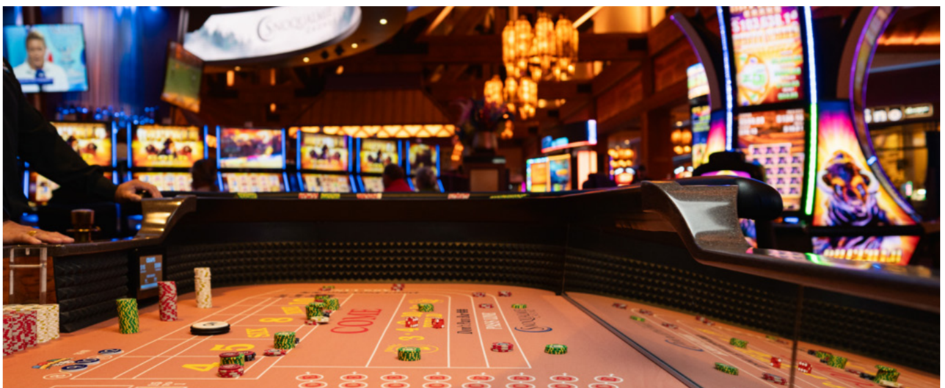
A total of nearly 1,800 slot machines and 58 Vegas-style table games are secured by Dallmeier solutions.

Planning and implementation were carried out in close cooperation with integrator North American Video (NAV), who adapted the system to the spatial conditions and operational processes as required. “The long-standing and solution-oriented cooperation with all parties