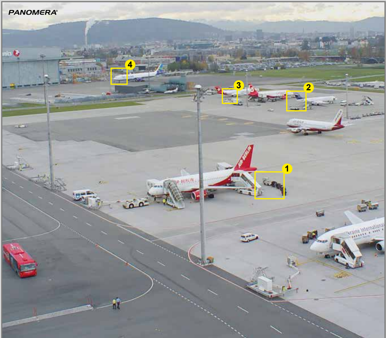
Distance ≈ 200 m / 650 ft

The Panomera® effect begins where conventional HD and megapixel cameras reach their limits.