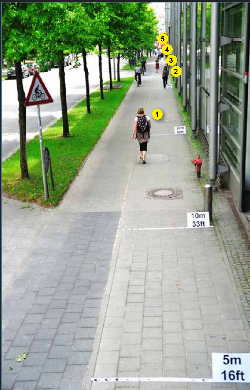
Dallmeier Panomera® DP6000 Long Distance camera compared to Nikon D7000

The Panomera® effect begins where conventional HD and megapixel cameras reach their limits.